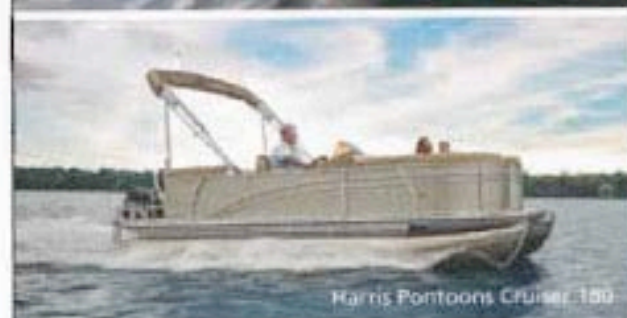
Harris Pontoon Cruiser 180