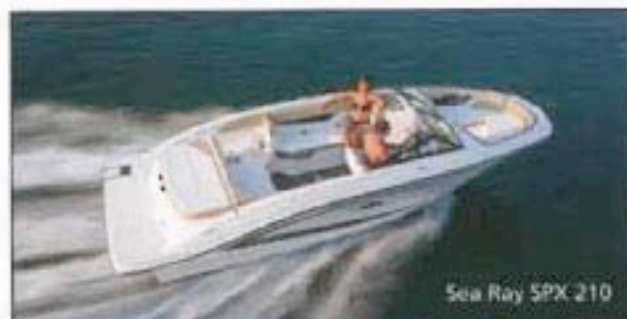
Sea Ray SPX 210

The CFR Diaper Bank, which is the only one in Morris County and one of nine in New